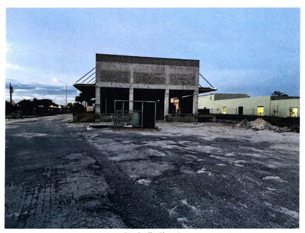
Exterior Site Photo 1 North end of building