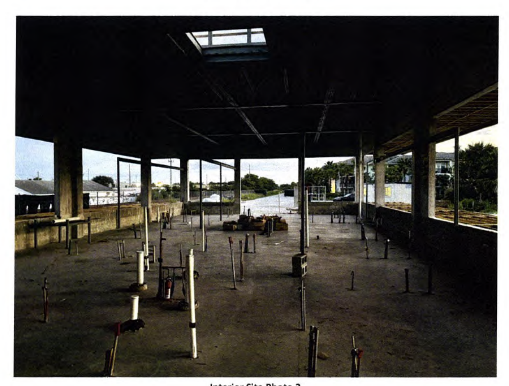
Interior Site Photo 2 North end of building