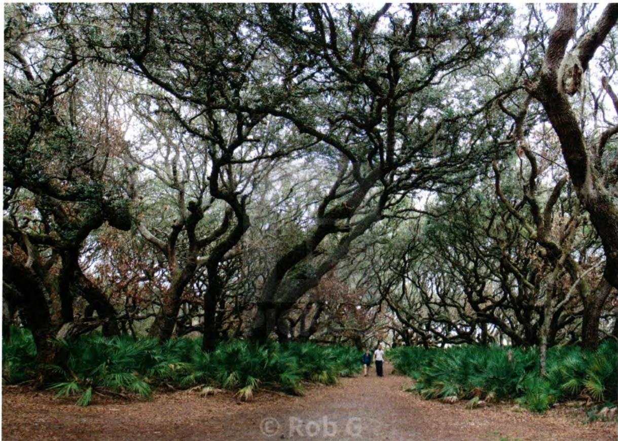
Cumberland Gap, Georgia