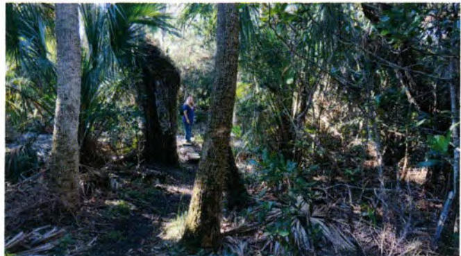
Maritime Hammock Park, Melbourne